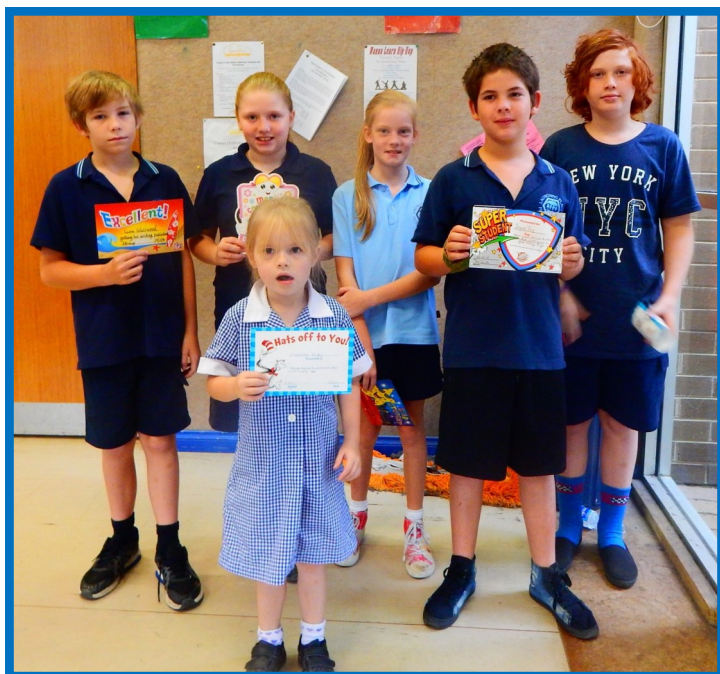
Twenty students received achievement awards at assembly. Well done everyone on your outstanding efforts.